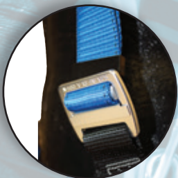
Aluminum Torso Adjustors