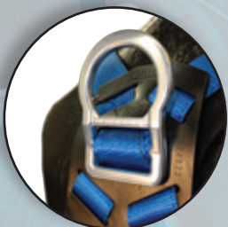
Stand-Up Aluminum Dorsal D-Ring