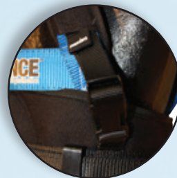
Back Belt Position Adjustors