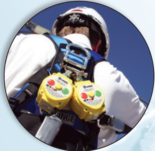
Ideal for use with the Reliance StopLite®