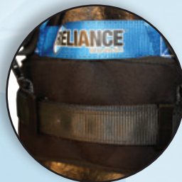
Integrated Back Belt (812000)