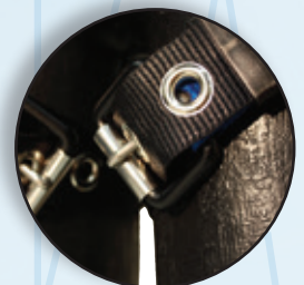
Silver Aluminum Grommets