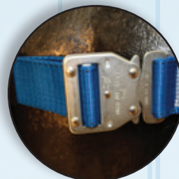
Slim Profile Quick Connect Chest Buckle