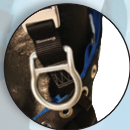
Aluminum Positioning D-Rings (802000)